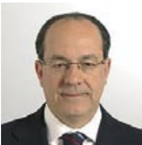
Paolo De Castro Chairman of the Committee for Agriculture and Rural Development European Parliament

It is now the time to thoroughly debate on meaningful and efficient solutions to reach these goals within the next CAP. Shaping the new policy to deliver food security for consumers; reasonable incomes for the farmers and public goods for the whole of the society it is a duty for scientist and policy makers alike.